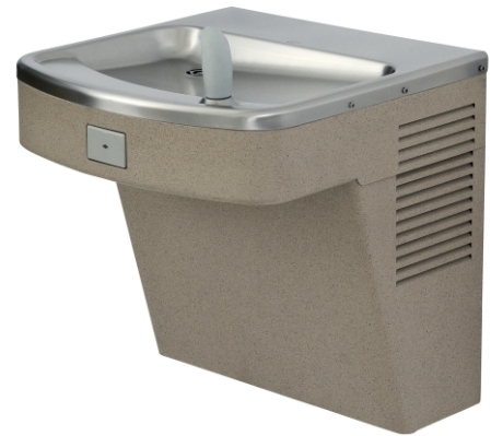
Model A171108F Shown ** U.S. DESIGN PATENT PENDING

Maintenance Advantage™ Water Cooler by Acorn Engineering Company